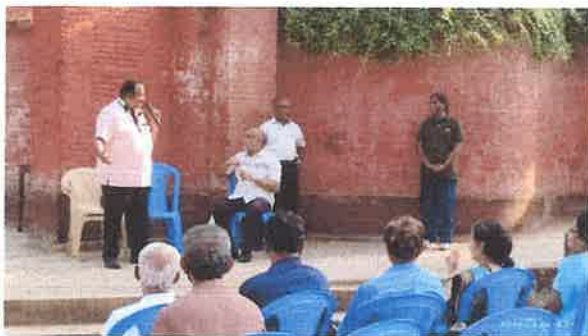
Figure 12 - YMCA Retirees Retreat