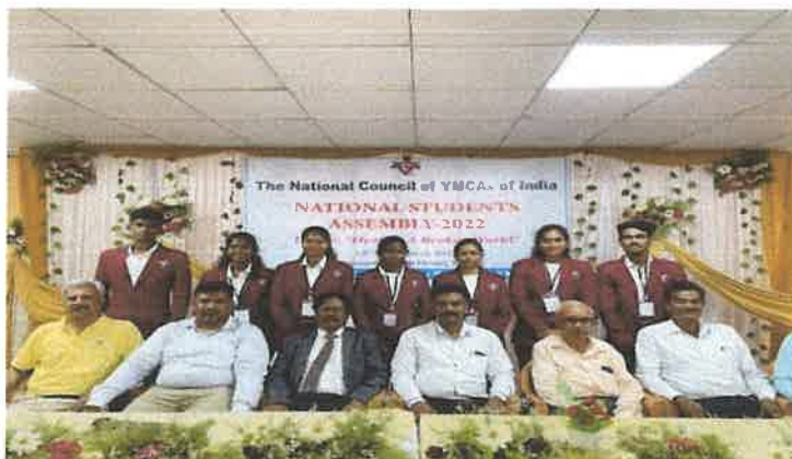
Figure 8 - National Youth Assembly