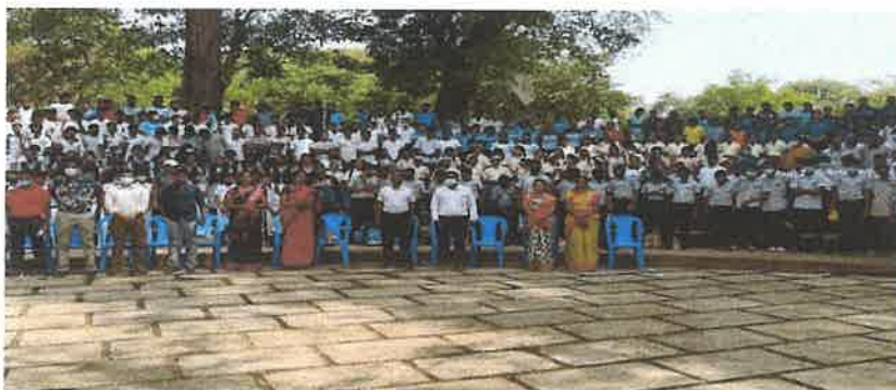
Figure 7 - Inter School Competitions