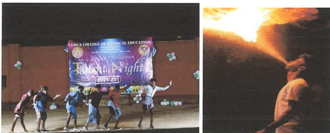
Figure 9 - Cultural Activity