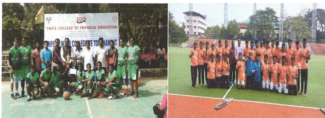
Figure 1 - Hockey Men & Women