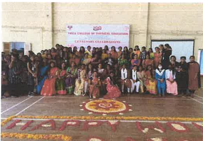
Figure 6 - Women's Days Celebration