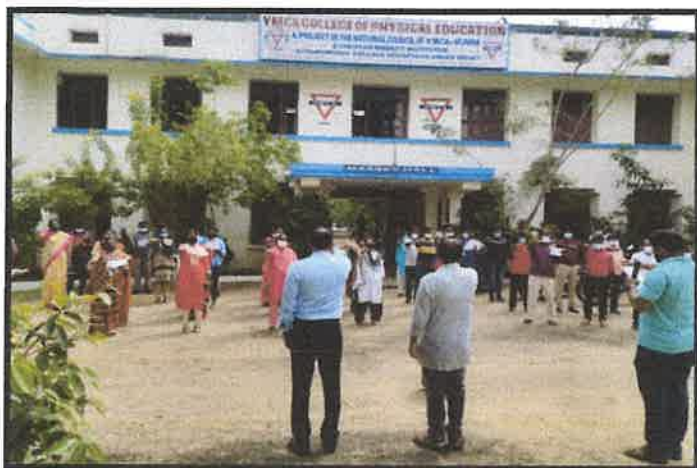
Figure 3 - Voter's Day Pledge