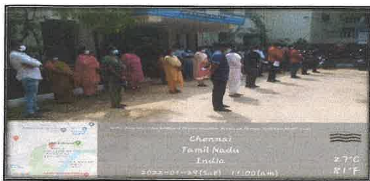
Figure 5 - Martyrs Day Observance