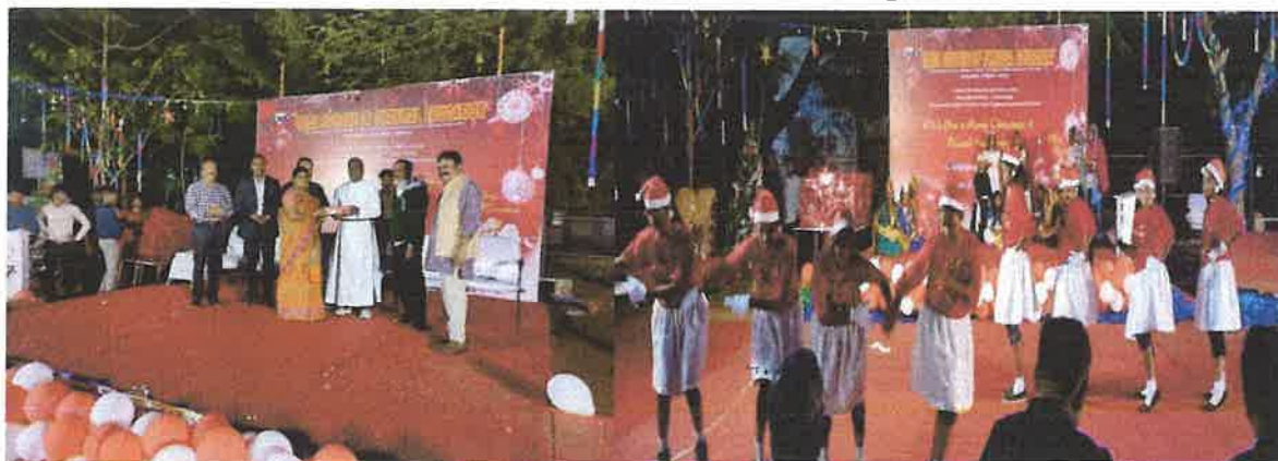
Figure 2 - Christmas Celebration