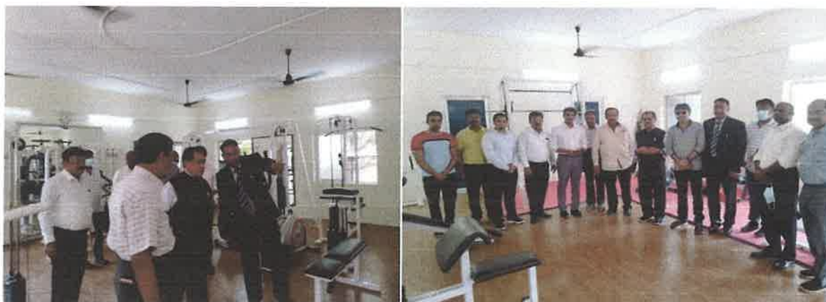
Figure 11 - Gym