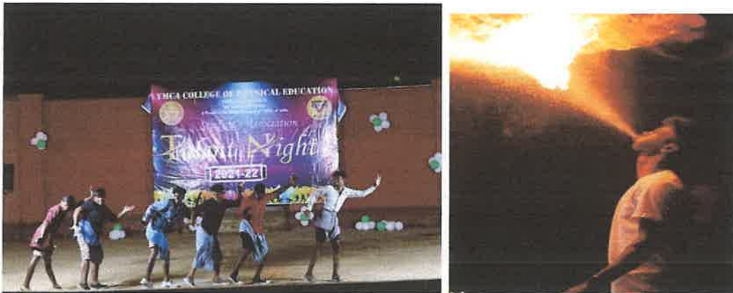
Figure 9 - Cultural Activity