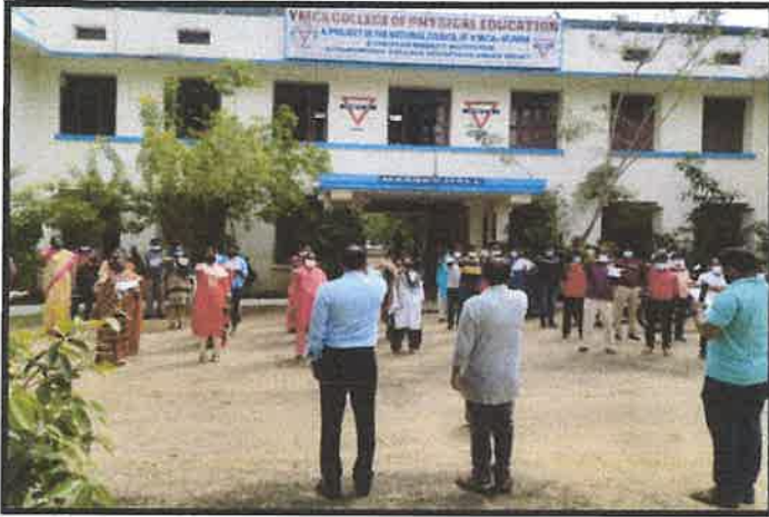
Figure 3 - Voter's Day Pledge