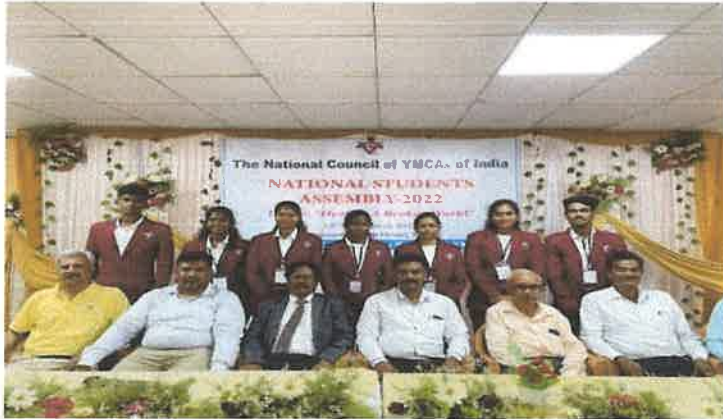
Figure 8 - National Youth Assembly