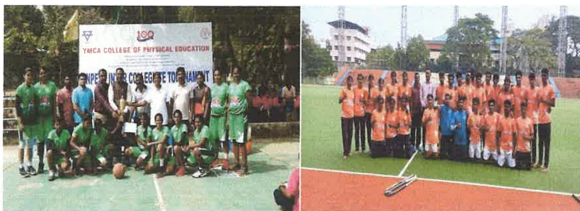
Figure 1 - Hockey Men & Women