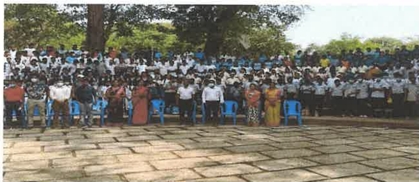
Figure 7 - Inter School Competitions