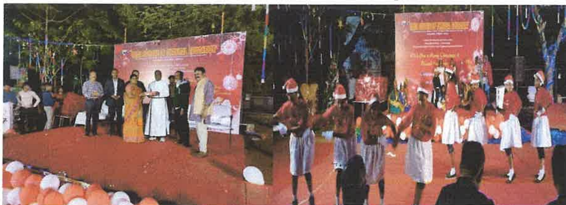
Figure 2 - Christmas Celebration