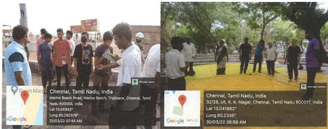
Figure 10 - Village Placement Programme