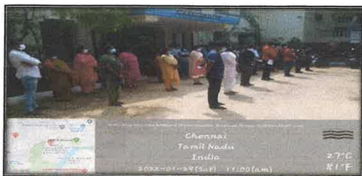
Figure 5 - Martyrs Day Observance