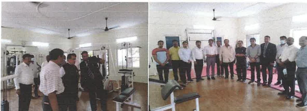
Figure 11 - Gym