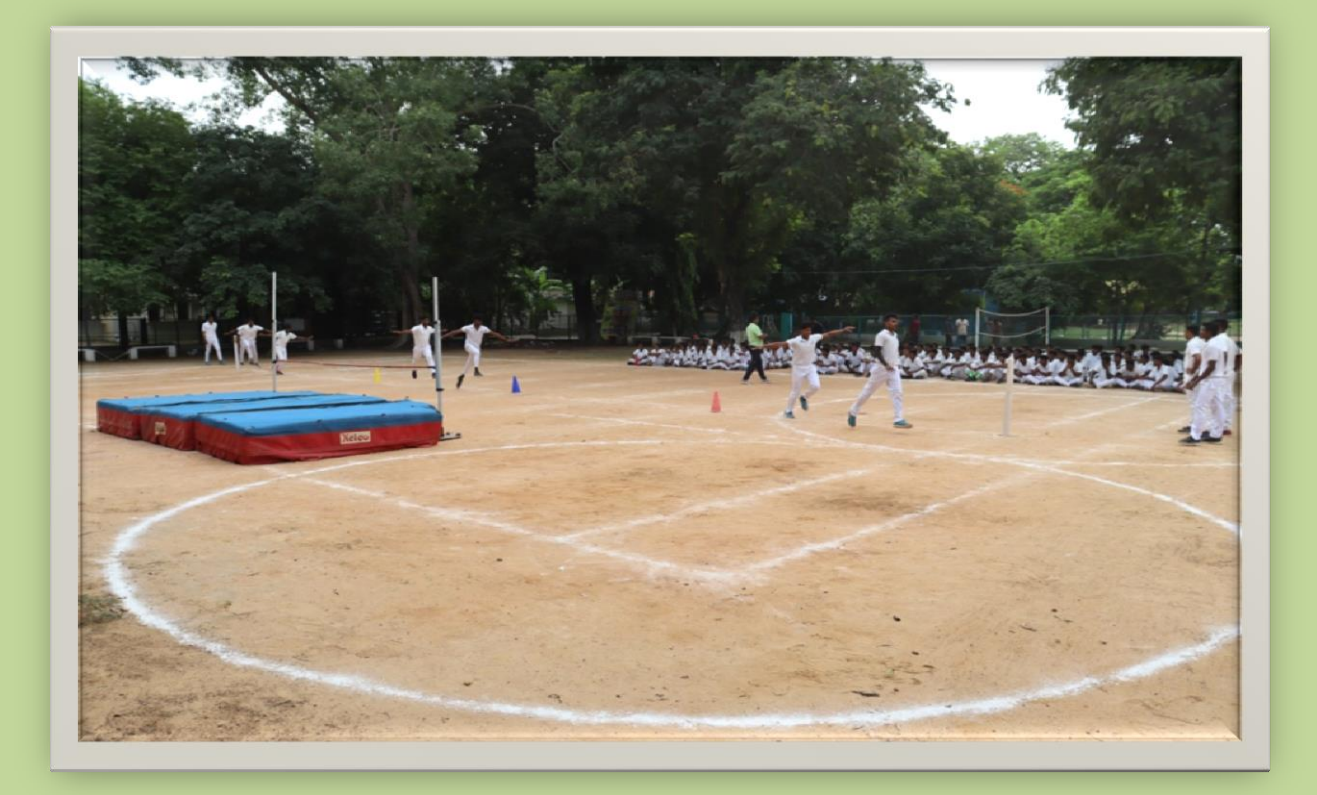
Figure 17 Evolving demonstration method