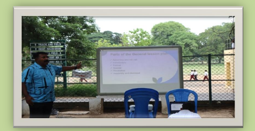
Figure 2 Formulating Lesson Objectives