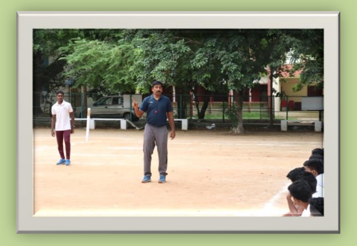
Figure 8 Assessing students learning