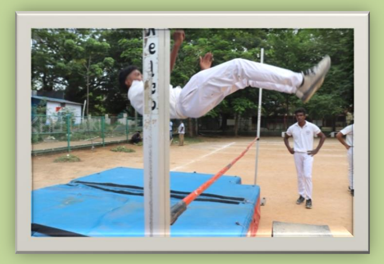
Figure 19 Assessing students learning