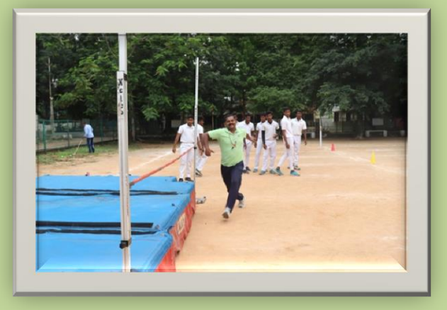
Figure 15 Mobilizing Relevant and varied learning resource