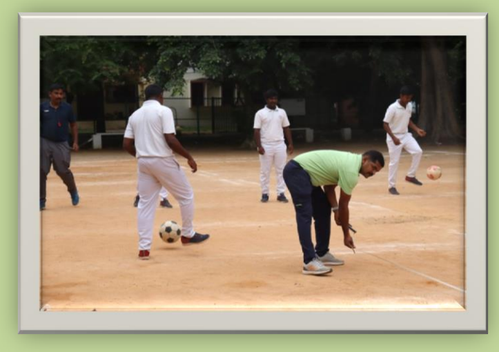
Figure 6 Visualizing differential learning activities according to student needs