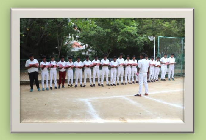
Figure 14 Assessing students learning