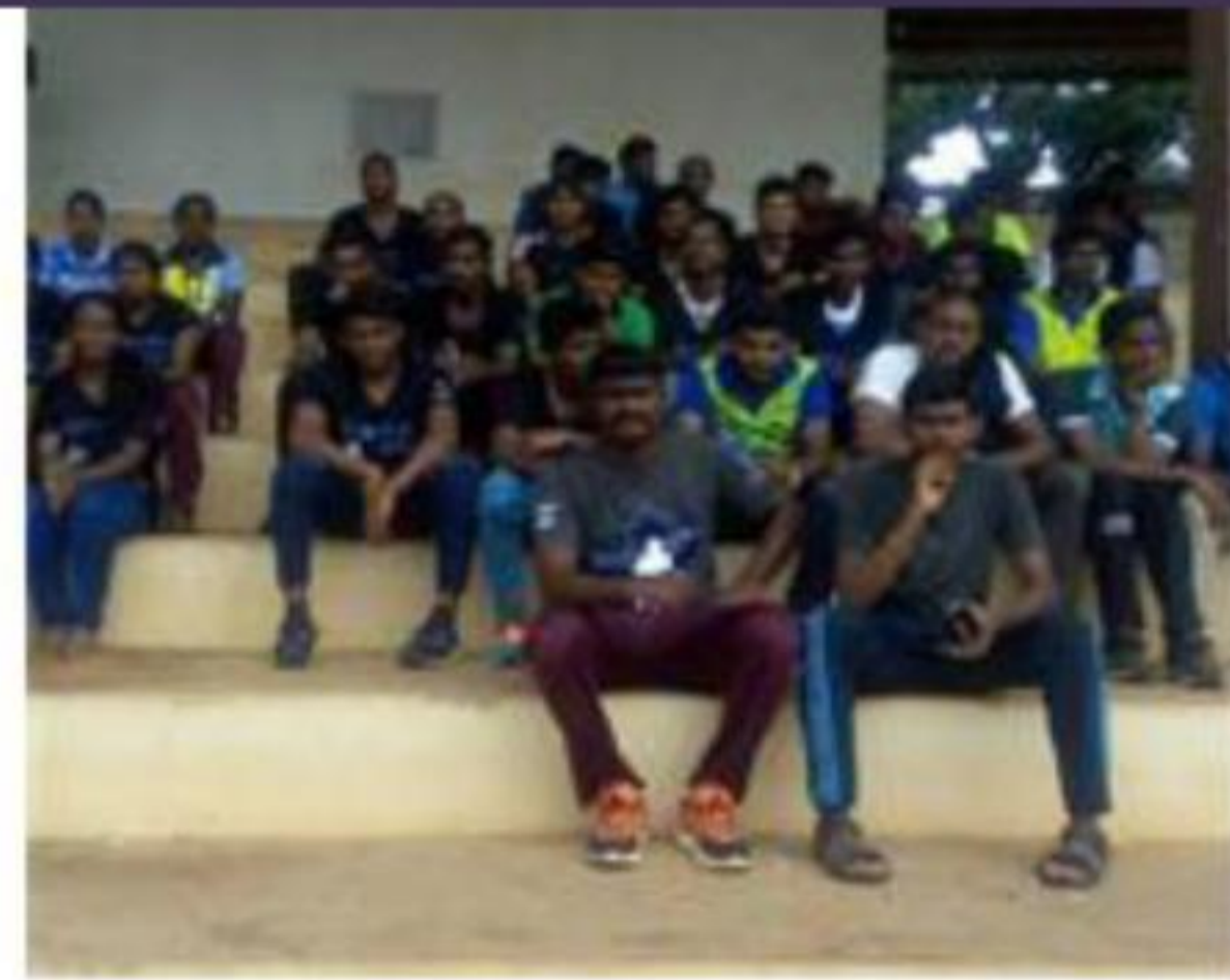
Sept 17 - Terry Fox Run Volunteers