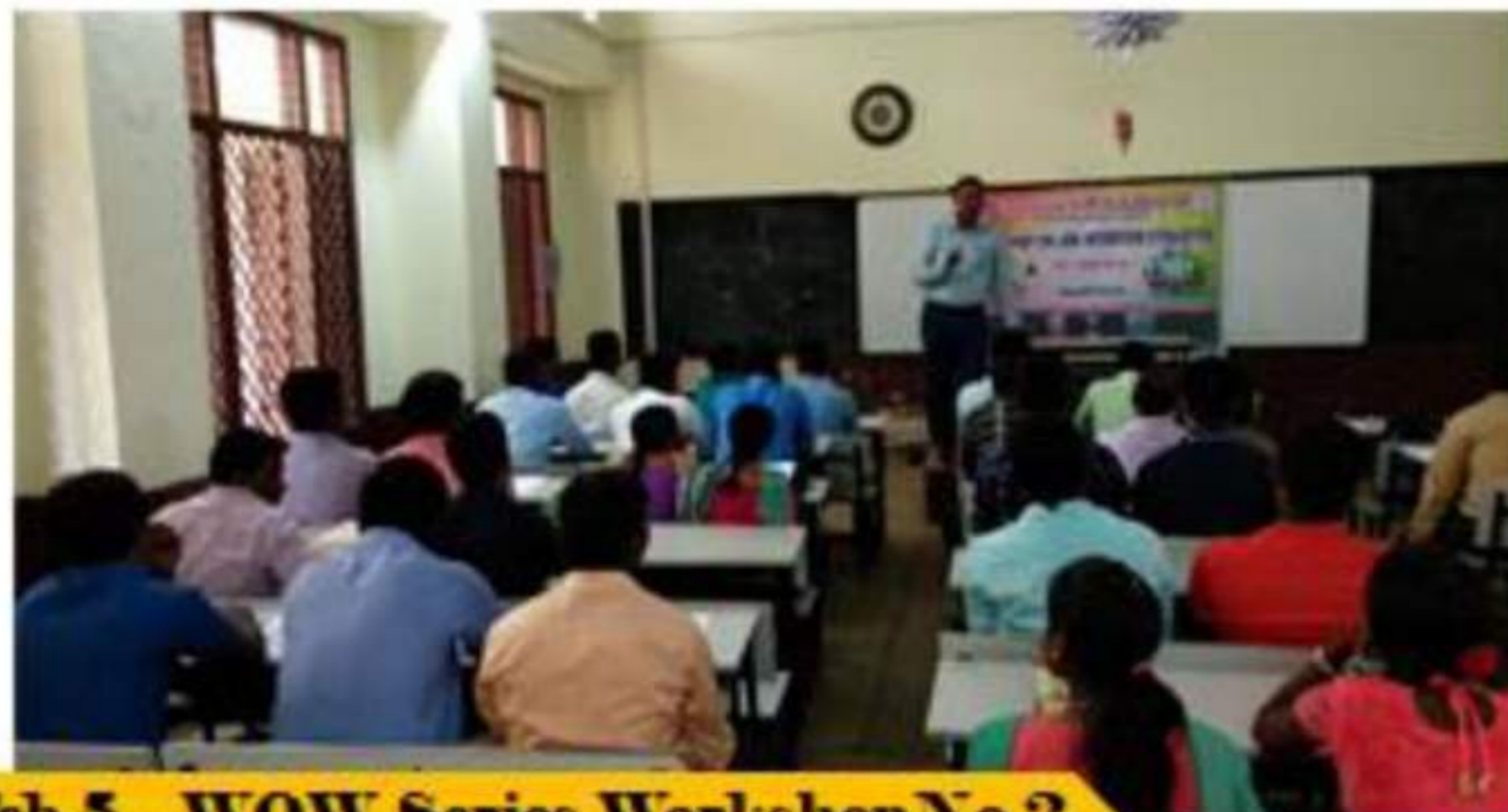
Feb 5 - WOW Series Workshop No.2