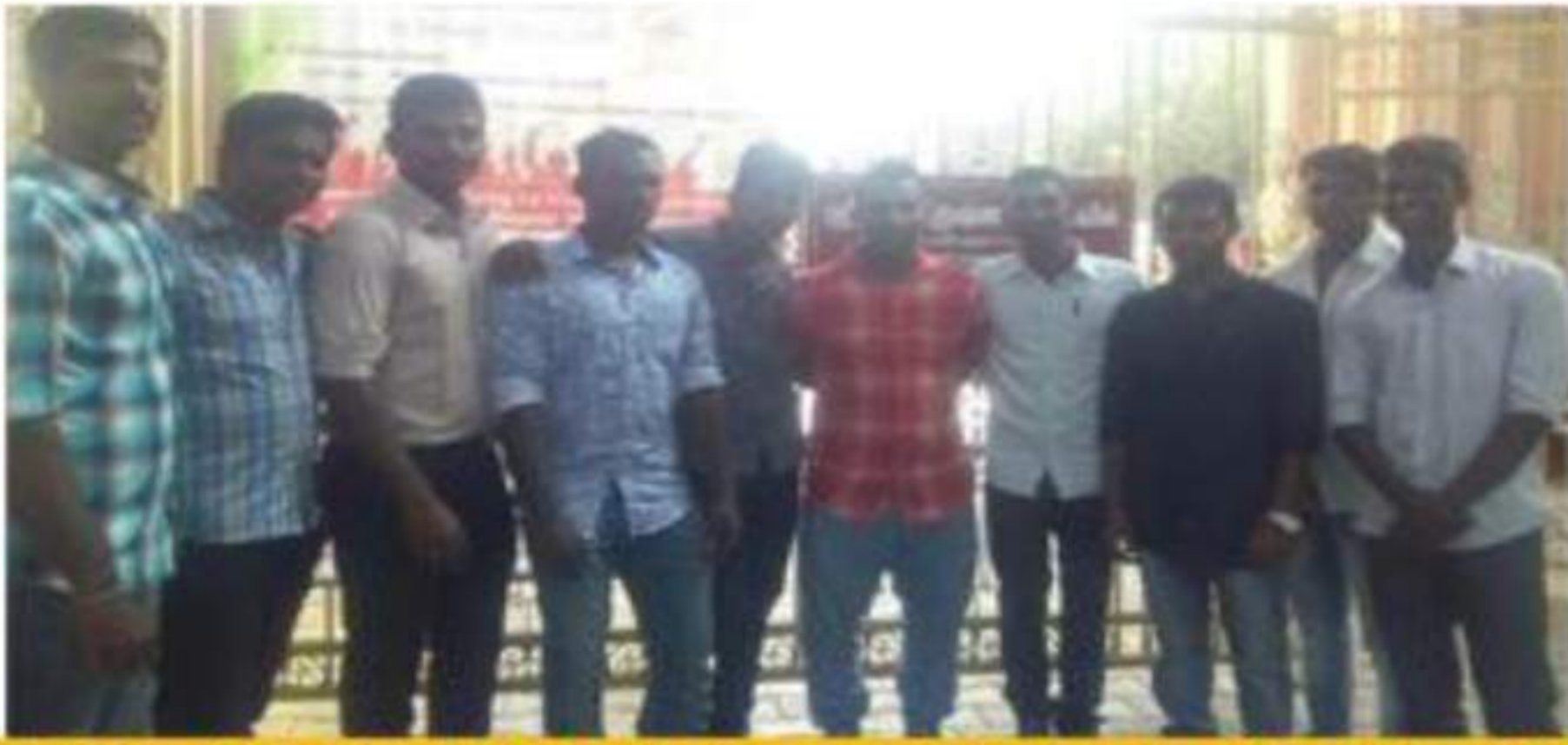
Jan 12 - National Youth Day Leadership Training Program