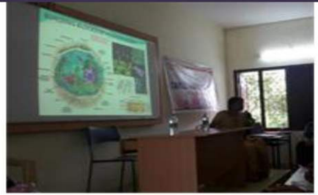
Sept 21 - Cancer Awareness Talk for Sports Woman