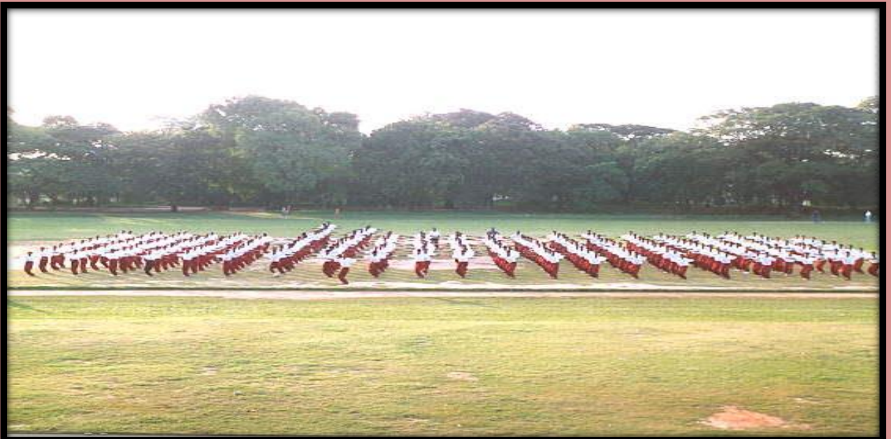
STUDENTS TEACHERS INVOLVED IN COACHING