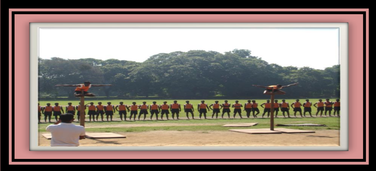
AT YELLAGIRI TRACKING – ANNUAL LEADERSHIP CAMP