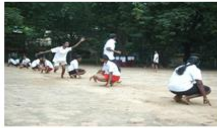
KHO – KHO GAME