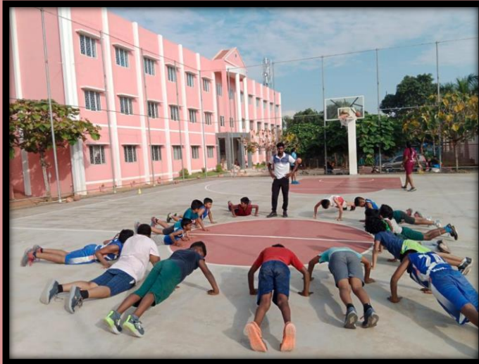
STUDENTS PARTICIPATING IN COLLEGE ACTIVITIES